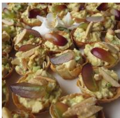
Curry Chicken Salad

Our Hors D'oeuvres selections are perfect for those who want to create an entire event around little tastes of varying flavors, or just as perfect as a supplement with your own creations!